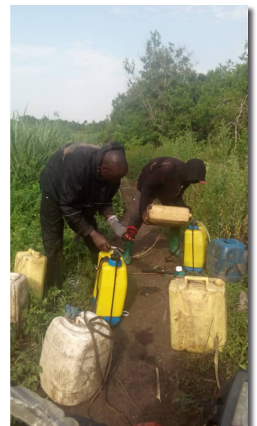
Workers preparing pesticides for the crops.

Education has the power to make our world a better place to live. One acre of sugarcane can yield a minimum of twenty-nine tons and a maximum of forty; for the children it will yield a lifetime of knowledge, knowledge that can reduce poverty, make people healthier, increase income and foster peace. Should you find it in your heart or budget to support these efforts, see the enclosed donation form. Thank you for all your past support and with your help we can do great things!