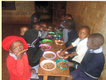
Orphan children having lunch at SFS Primary, Chera

The light of the Advent wreath is growing; for those in Africa, in their darkness they perceive this far better than I. And that special "Someone", our true light, will fill their empty hearts, and the night of this pandemic, it "too will pass."