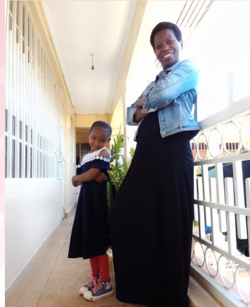
Mother & daughter moment

things that most children take for granted. There was a time when she couldn't go to school, or even play outside with her peers. That has all changed now because you made a little girl's dream come true. Thanks again, you serve the Lord so faithfully!