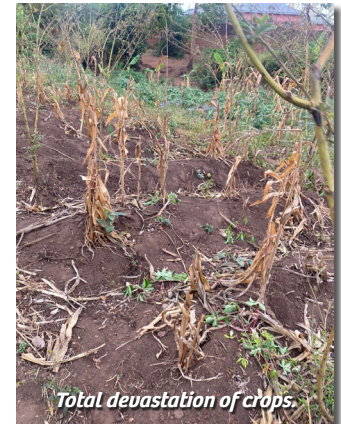
Total devastation of crops.